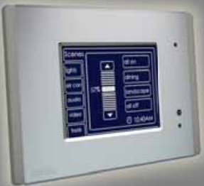
5050CT2,GB - without Logic Engine 5050CTL2,GB - with Logic Engine