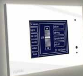
SC5000CT2,WE - without Logic Engine SC5000CTL2,WE - with Logic Engine