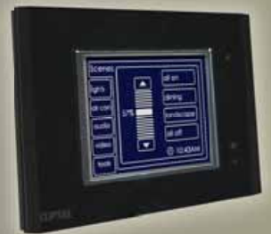
5080CT2-6 - without Logic Engine 5080CTL2-6 - with Logic Engine