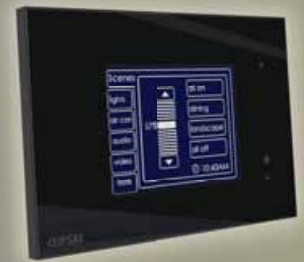
SC5000CT2,BK - without Logic Engine SC5000CTL2,BK - with Logic Engine