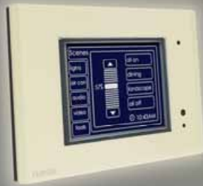
5080CT2-3 - without Logic Engine 5080CTL2-3 - with Logic Engine