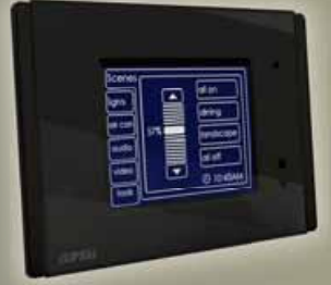
5050CT2,BK - without Logic Engine 5050CTL2,BK - with Logic Engine