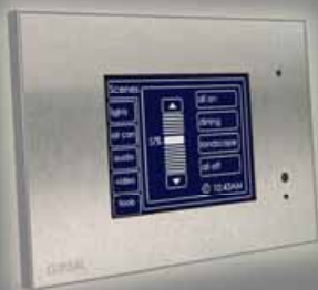
BS5000CT2 - without Logic Engine BS5000CTL2 - with Logic Engine