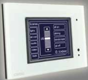
5080CT2,GF - without Logic Engine 5080CTL2,GF - with Logic Engine