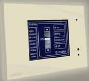
SC5000CT2,CM - without Logic Engine SC5000CTL2,CM - with Logic Engine