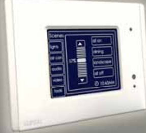
5050CT2,WE - without Logic Engine 5050CTL2,WE - with Logic Engine