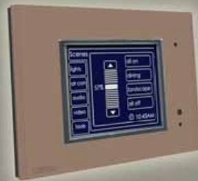
5080CT2-7 - without Logic Engine 5080CTL2-7 - with Logic Engine