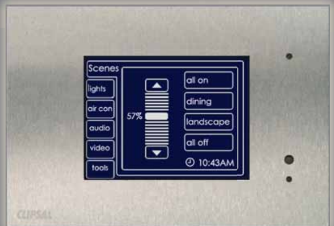
Super bright LCD screen with 50% more screen area than MKI.