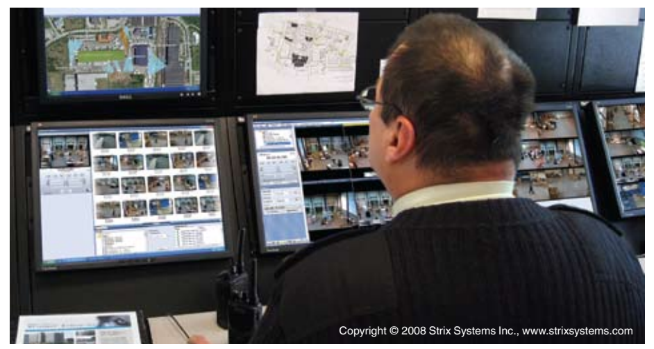
The Milestone XProtect Smart Client provides exceptional control, efficiency and adaptability