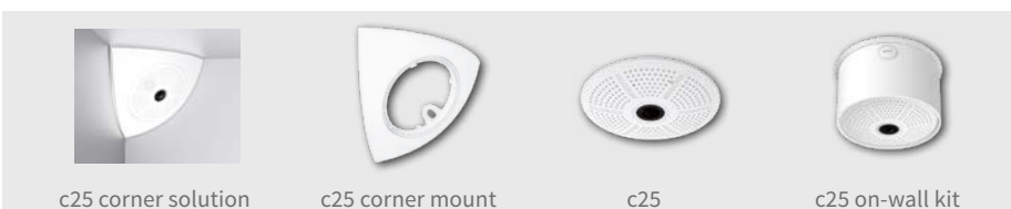
c25 corner solution