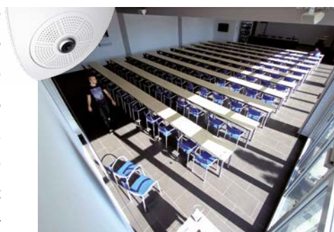
Corrected corner view with 103° (B036) premium lens

All indoor cameras are available with product options such as complete two-way audio, including microphone and loudspeaker. This system offering is easy to expand and perfect for small offices and shops, retail stores, hotels and restaurants, museums, health care, universities and schools. An optional expansion board can be plugged on the backside of the camera to realize additional IO- and alarm functions.