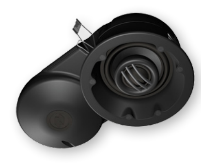
Packaged Individually with Round MicroThin™ Grille

For smaller spaces or wherever preventing sound bleed-through to other spaces is critical