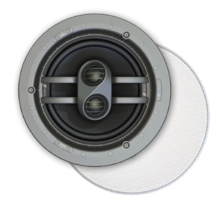
Packaged in Pairs with Round MicroThin™ Grilles Stock Number

For advanced home theaters and primary listening rooms