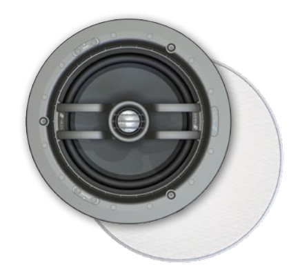
Packaged Individually with Round MicroThin<sup>™</sup> Grille

For advanced home theaters and primary listening rooms